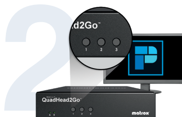
Configure using on-device buttons or the Matrox PowerWall software