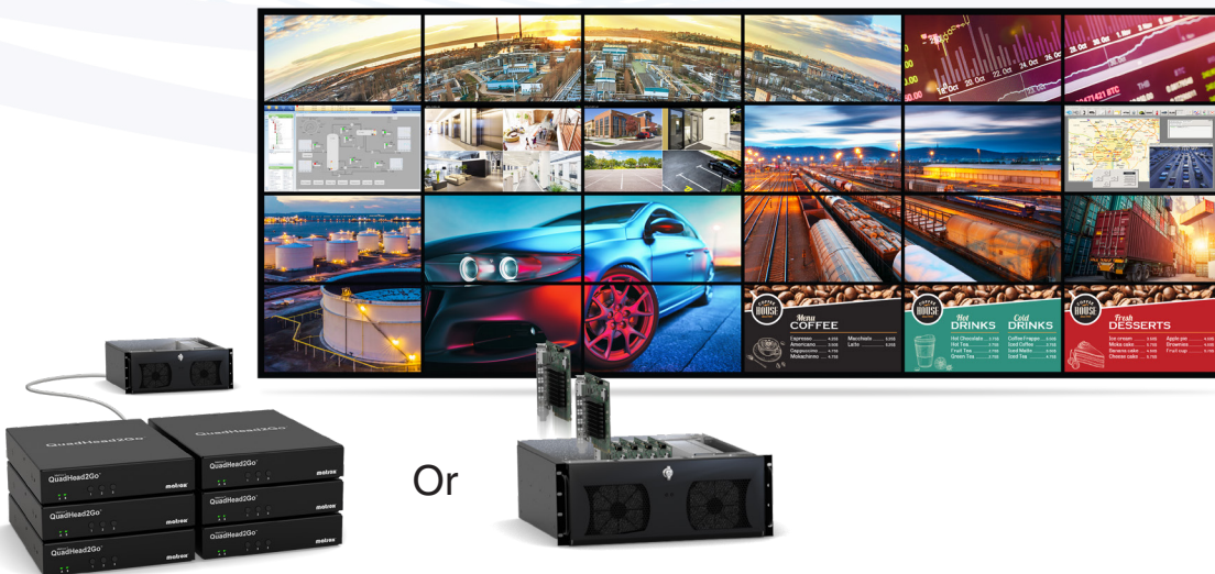
Use multiple QuadHead2Go units (appliances or cards) to easily create and/or expand large-scale video wall solutions