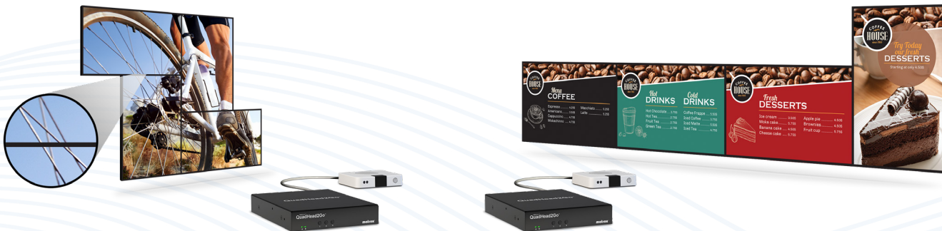
Fine-tune bezels for seamless image displays