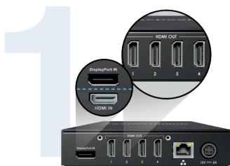
Connect using DP 1.2 or HDMI input and 4 HDMI outputs