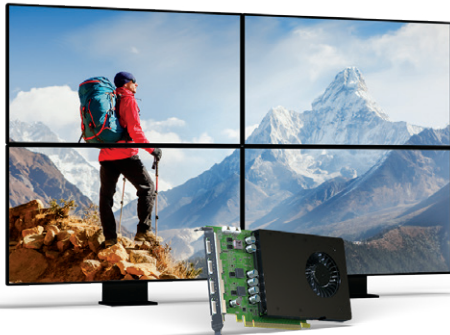
D-Series D1450 - Quad HDMI graphics card

Full-height, Gen 3 PCIe® x16 four-output graphics cards with four native HDMI® or DisplayPort™ connectors deliver the best display density, resolution, and performance for demanding multi-monitor applications.