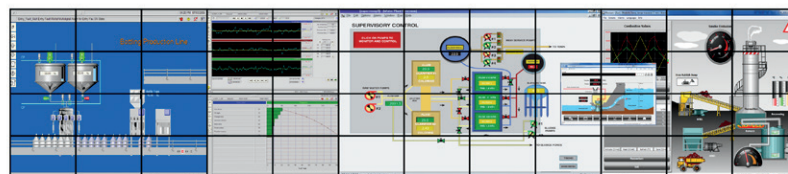
Combine with Matrox QuadHead2Go to build large-scale video walls