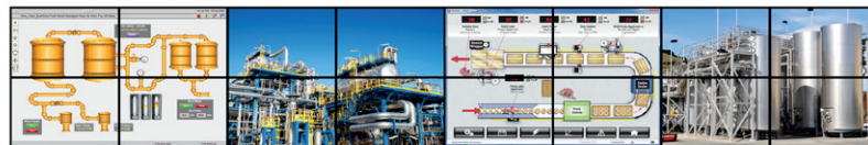
View critical information across an expansive configuration

Matrox D-Series supports numerous types of video walls and helps you create the optimal setup for every need. With a single card you can power four-monitor video walls to deliver high-impact configurations. By combining four cards, you can build larger 16-monitor video walls, or create even larger scale video walls by pairing the D-Series cards with the Matrox QuadHead2Go multi-monitor controller cards or appliances.