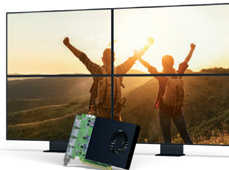
D-Series D1480 - Quad DisplayPort graphics card