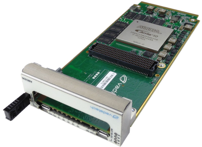
Figure 1: AMC536

See Intel FPGA Solutions for the advantages of using VadaTech products during application development.