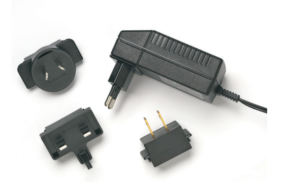
Worldwide compatible AC adapter/charger (SNT-121A)