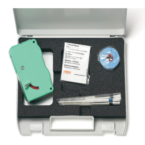
OCK-10 Optical Connector Cleaning Kit (accessory)