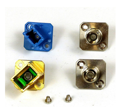
Optical adapters (BN 2155) for signal input