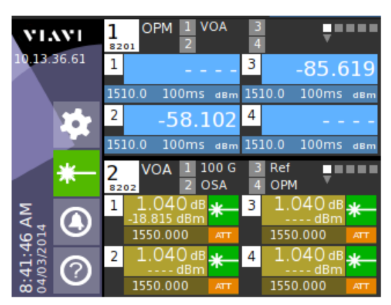
As with all MAP-200 platforms, field maintenance is a priority. The power supply/controller unit is field-replaceable. For integrated test systems, this modularity minimizes maintenance down time.