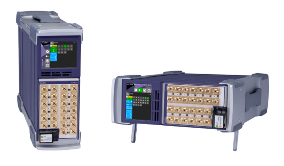
MAP-220C with installed mOSW Optical Switch module

Because each lab bench is unique, the MAP-220C LightDirect Chassis can be flexibly deployed in the space available. Easily stackable and simple, intuitive flip-up feet for easier positioning. The touch screen display's orientation-sensing ability enables positioning the chassis for use vertically or horizontally.