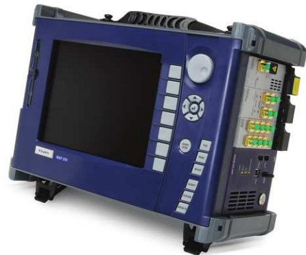
Figure 2a . Mounting the MAP-200KD on the MAP-230 is the optimal configuration for applications where users frequently require GUI access.

As Figure 2a shows, the MAP-230 mainframe can be used with the MAP-200KD module mounted on top of it. The pop-out feet on the mainframe let users position it in a front-facing manner for optimal viewing and interaction.