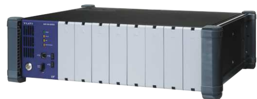
Figure 2b. Configuring the MAP-200KD next to the MAP-280 is optimal for applications where users require access to the device under test, the MAP-200 modules, and the GUI.