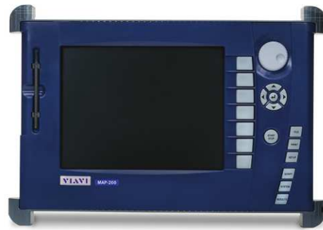
Figure 1. Keypad/display module

The graphical user interface (GUI) and local control of the MAP-200 mainframes work with standard universal serial bus (USB) keyboards, USB mice, and digital video interface (DVI) monitors. For added convenience and flexibility, Viavi offers an optional purpose-built keypad/display module (MAP-200KD) for local control capabilities, as shown in Figure 1. The MAP-200KD features a scroll wheel, seven soft keys, five navigation buttons, and seven pre-assigned buttons for use in navigating the GUI. Touch capability and user-friendly controls come standard for operation at the touch of a finger or with the supplied stylus. Located at the back of the MAP-200KD module is an industry-standard mounting port compatible with commercially available display mounts or the purpose-built MAP-200 keypad display 19-inch rack-mount kit (MAP-200A09). Alternatively, users can access the GUI using a PC via a virtual network connection (VNC) client.